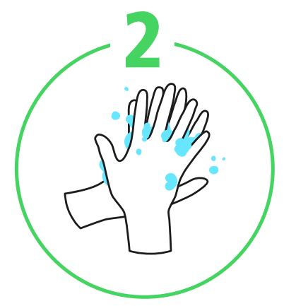
The backs of hands