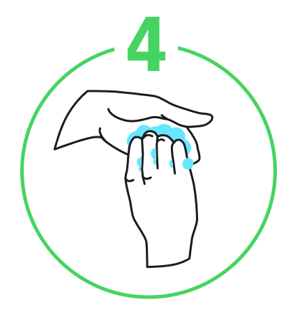
The back of the fingers