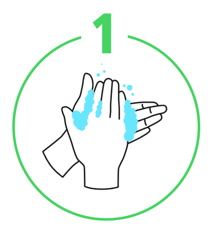
Palm to palm

Wash your hands with soap and water more often for 20 seconds